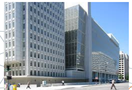
World Bank HQ, Washington DC,