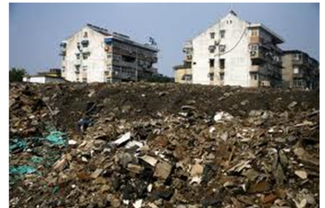
Unregulated Dump Site

Integrated Skills Limited, operating internationally out of Romsey near Southampton, Hampshire, is a specialist provider of GIS based software solutions including contractor management systems, routing and optimisation software solutions and street works coordination software as well as